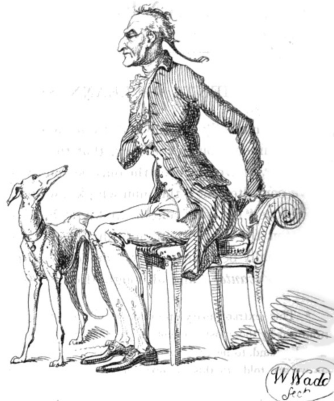
Lineaments of Leanness.

Published by John Eves & Co. London. 1828.