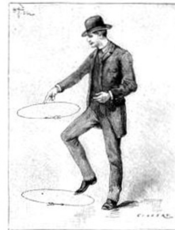
Can you make your hand and foot together follow the direction of the arrows in the diagram?