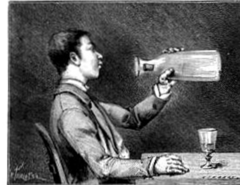
Place a piece of cork in the mouth of a bottle and attempt to blow it into the bottle. The harder you blow the harder will the cork fly out.