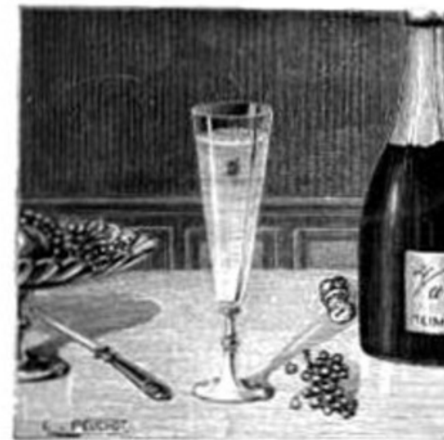
Place a raisin-pip in a glass of champagne or soda-water. The pip will sink, but the bubbles which form upon it will float it again to the surface, where the bubbles break and the pip again sinks; and thus the pip alternately rises and sinks.