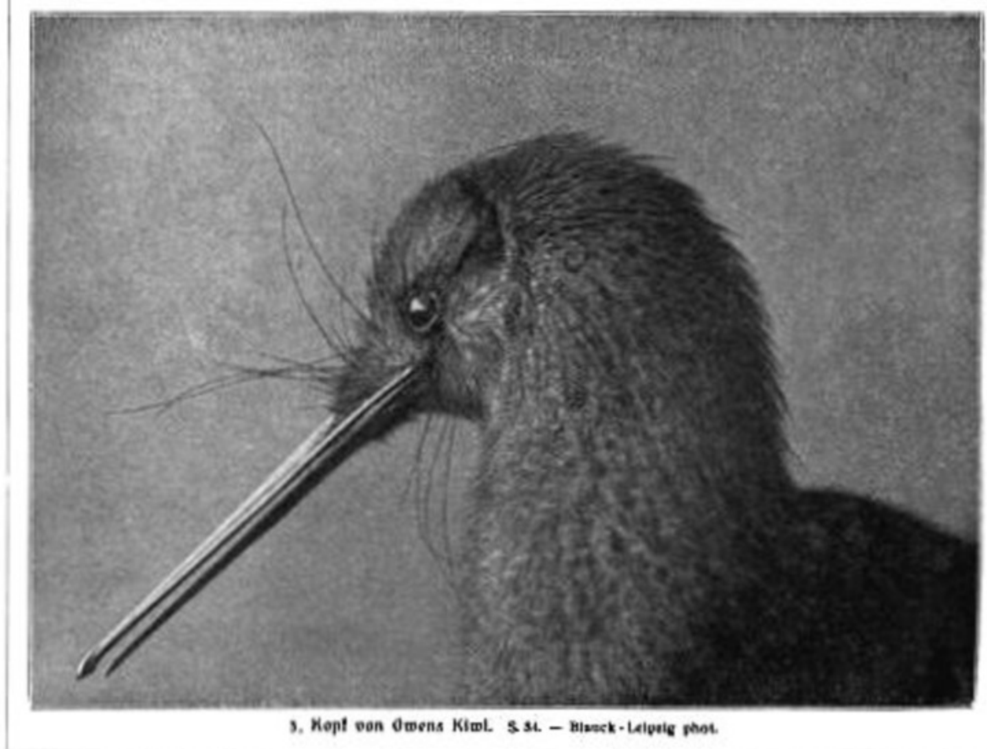
3. Kopf von Omens Kital. S. 54.